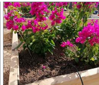
Figure 7 • Bougainvillea plants.