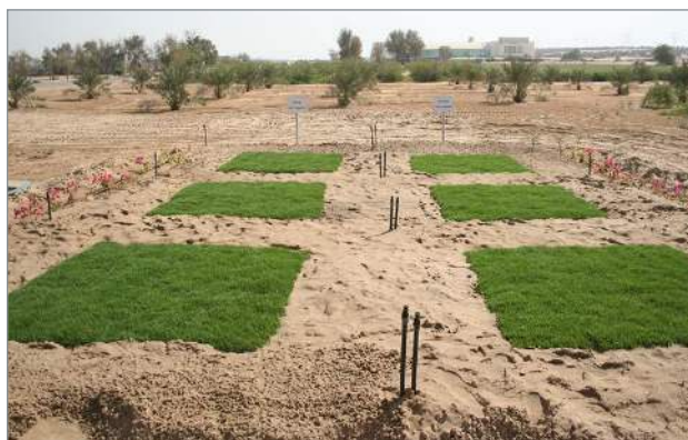
Figure 1 • Experimental site of perlite testing at ICBA.