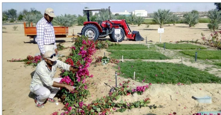
Figure 2 • Pruning of bougainvillea branches (Photo courtesy of Gulf Perlite).