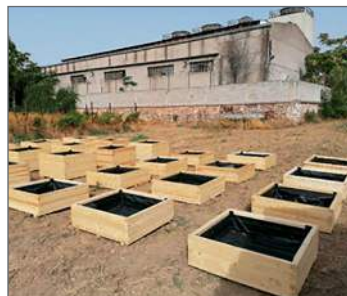
Figure 4 • Empty containers that hosted turf grass and Bougainvillea plants.