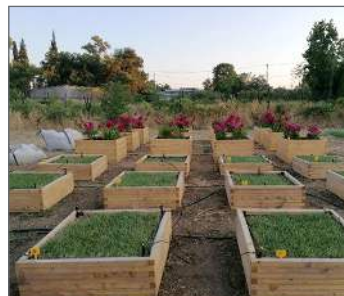
Figure 6 • Grass containers.