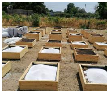
Figure 5 • Construction phase: fine perlite addition in containers.