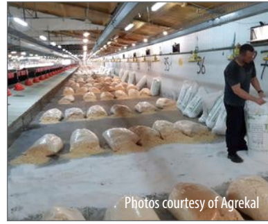
Figure 2 • Combined use of expanded perlite and wood chips as bedding material for poultry.

hard shell that protects them from drying out and against the penetration of toxins. Drier muck prevents the development of the larvae; thus, it is preferable to keep muck as dry as possible. The second condition for the fly's development is a comfortable temperature, which exists in Israel from April through November. In these conditions, the fly completes its life cycle in just 10–14 days, hence the rapid multiplication of flies in spring, summer, and autumn. Interestingly, according to some estimates, the number of adult flies at any given moment is only 30% of the total population; the rest are eggs, pupae, and larvae.