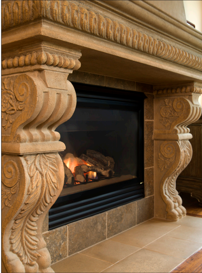
Perlite cultured stone and gas fireplace logs

This product guide contains various mix designs for lightweight concrete, utilizing perlite as the primary aggregate, which may be used as stated or as a starting point for your own custom mixes.